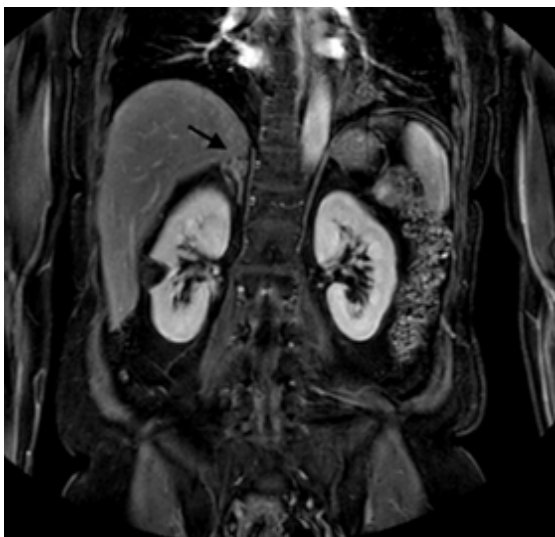
Figure 1. Angiomyolipoma and adenoma (arrow)