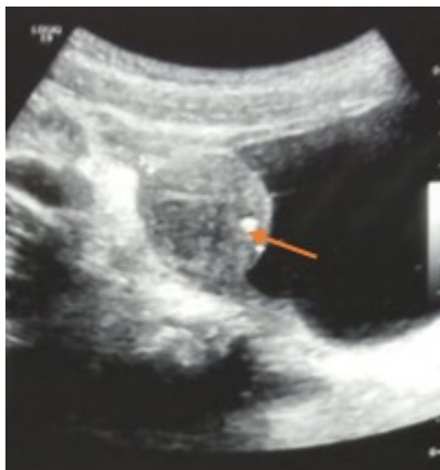
Figure 3. Ultrasound: Mass with defined borders in the bladder

During cystoscopy, the bladder was observed to have trabeculated walls with a mildly arboriform proliferation, as well as a mass protruding from the right wall of the bladder. A biopsy of the bladder wall mucosa was performed, and the histopathological report indicated the presence of eosinophilic cystitis, with a polymorphonuclear and lymphocytic inflammatory infiltrate, secondary follicle formation, and the presence of multinucleated giant cells (Figure 4).