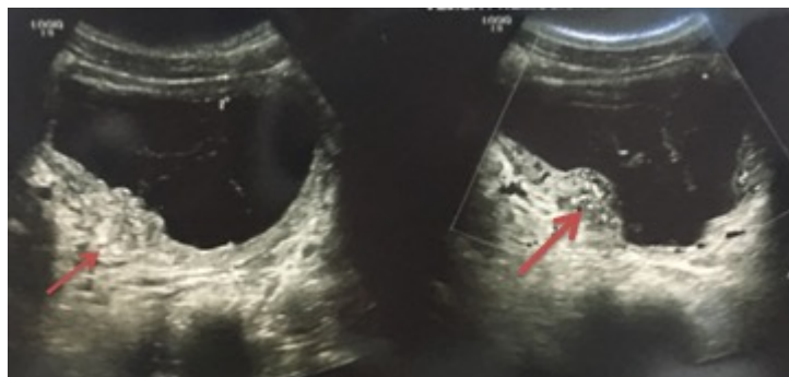
Figure 1. Ultrasound: bladder with thickened walls, hypoechoic, with internal septa with anechoic content inside

Simple and contrast-enhanced uro-tomography showed a detrusor muscle with irregular borders and concentric thickening of the wall, particularly in the posterior basal aspect, which became more pronounced when contrast was administered.